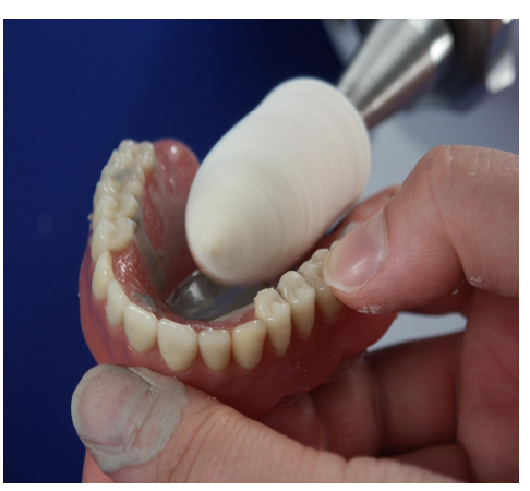
Example:Felt cone 50/50x25 mm (FKU 25 200)

Have you ever been annoyed because the gums are still not polished, whereas the prosthesis in the area of the palatal vibrating line has already lost some of its substance? If your answer is "Yes", then it is time you used our Felt Cones and our Dental Plate Brushes. The recommended speed is 1,500 rpm for both.