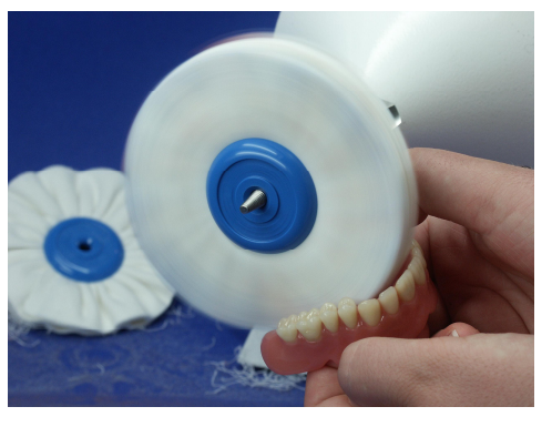
Pleated buffing wheel 29d/100 mm (SWK 28