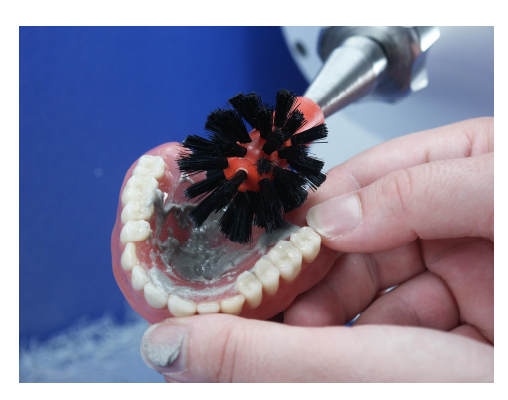
Example: Dental plate brush No. 145 (KOB 12